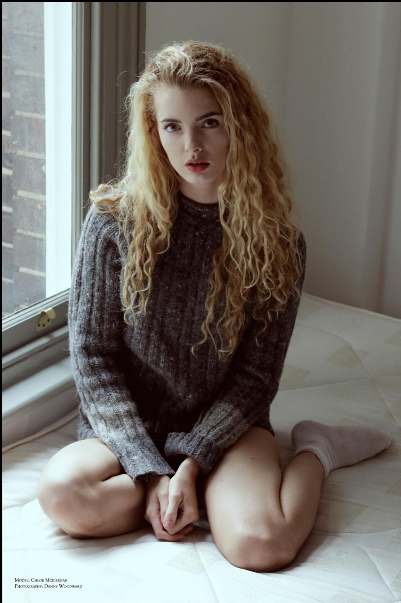
MODEL: CHLOE MCKIERNAN