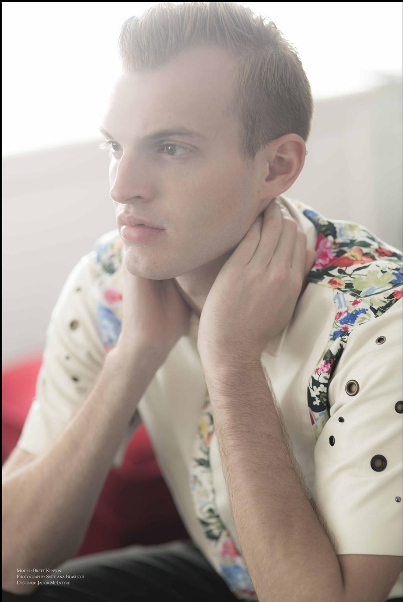
MODEL: BRETT KENYON DESIGNER: JACOB MCINTYRE